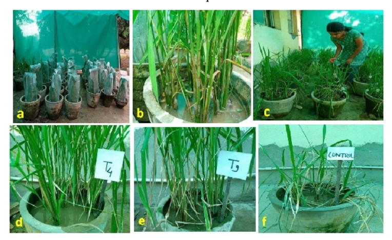
Plate 2. In vivo efficacy of Bacillus subtilis isolates against sheath blight of rice under pot conditions (a) After inoculation cover with polythene bag (b) First disease symptoms appearance (c) Spraying of different treatments of B. subtilis (d) superior treatment (e) Least effective treatment (f) Control.