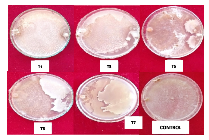
Plate 1. Efficacy of different isolates of Bacillus subtilis on mycelial growth of Rhizoctonia solani in dual culture technique.